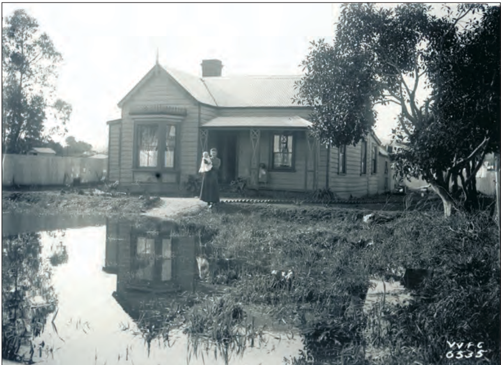
Fig 22: Flooding, Evans-Nield, 1910. Photographer unknown. Reproduced courtesy of the Tairāwhiti Museum, Gisborne, New Zealand (1910, WVFC1.4-6535).