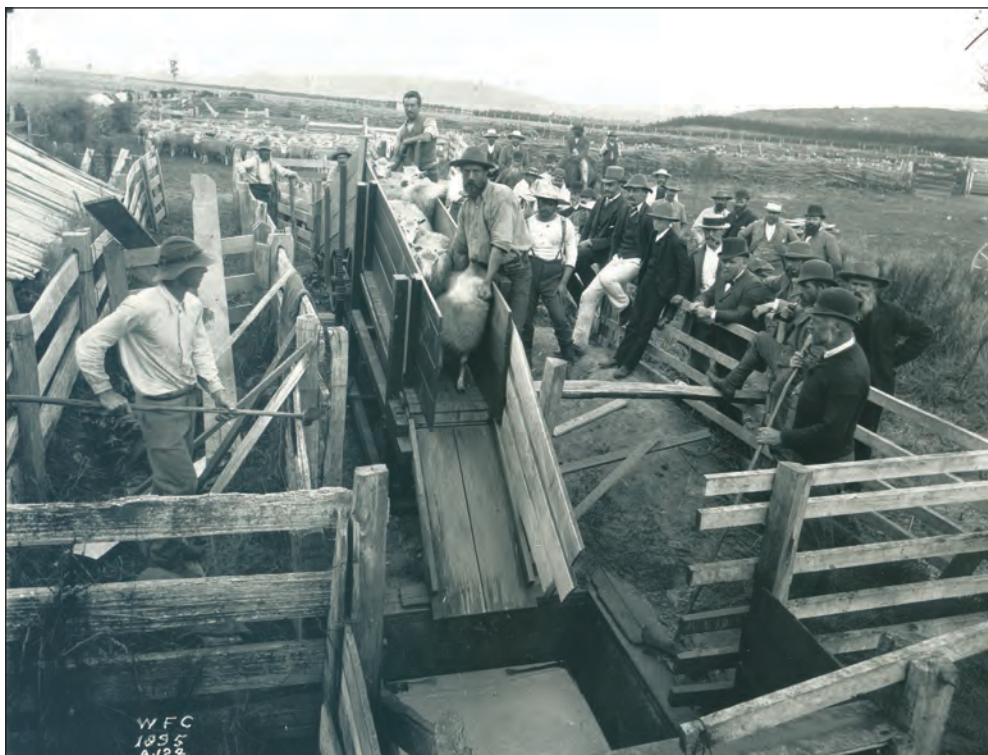
Fig 16: Sheepdipping at Barker's holding, Whataupoko, 1895.

Photographer unknown. Reproduced courtesy of the Tairāwhiti Museum, Gisborne, New Zealand (1895-A137).