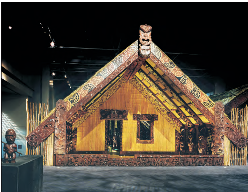
Fig 20: Te Hau ki Turanga in Manawhenua exhibition.

amount of money had been paid for it, and, because the owners of the land and the whare were 'rebels', the whare had 'strictly speaking' been 'forfeited to the Government'. 1