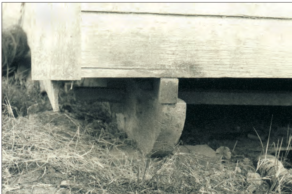
Fig 15: Close up of sled house runner.