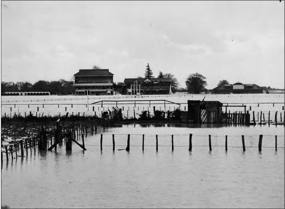
Fig 21: Makaraka racecourse under flood water, 1950.