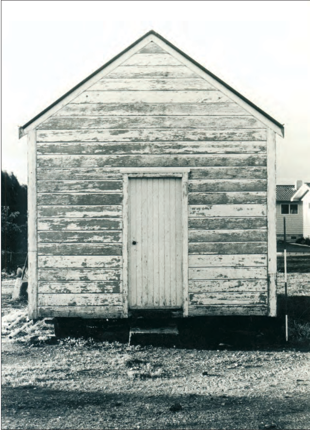
Fig 14: Sled house. The notice beside the sled house, which stands outside the Tairāwhiti museum, reads: 'The runners underneath allowed the house to be moved by a team of bullocks. This was needed in the 1870s when land possession was uncertain, floods frequent and fear of Hauhau uprisings general. The house's last site was in Bushmere Road.'