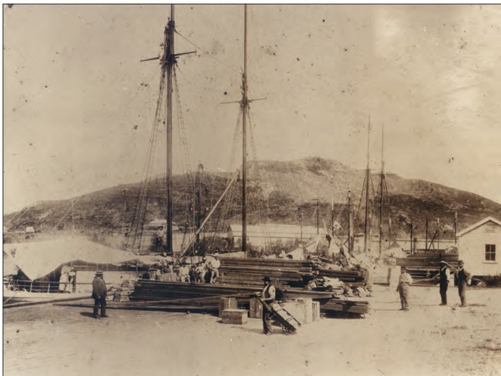
Fig 18: Read's Quay Wharf, 1896.